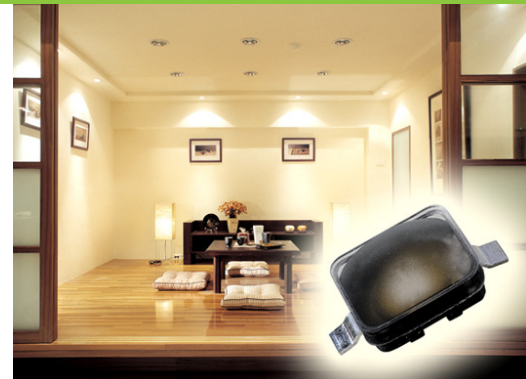
Diamond Dragon LED.

However, LED device efficacy doesn't tell the whole story. Good LED system and luminaire design is imperative to energy-efficient LED lighting fixtures. For example, a new LED recessed downlight combines multicolored high efficiency LEDs, excellent thermal management, and sophisticated optical design to produce nearly 700 lumens using only 6.5 watts, for a luminaire efficacy of 107 lm/W. Conversely, poorly-designed luminaires using even the best LEDs may be no more efficient than incandescent lighting.