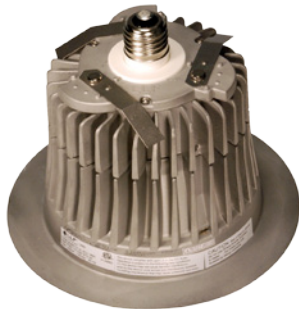
LED downlight showing heat sink.

Unlike other light sources, LEDs usually don't "burn out;" instead, they get progressively dimmer over time. LED useful life is based on the number of operating hours until the LED is emitting 70% of its initial light output. Good quality white LEDs in well-designed fixtures are expected to have a useful life of 30,000 to 50,000 hours. A typical incandescent lamp lasts about 1,000 hours; a comparable CFL lasts 8,000 to 10,000 hours, and the best linear fluorescent lamps can last more than 30,000 hours. LED light output and useful life are strongly affected by temperature. LEDs must be "heat sinked:" placed in direct contact with materials that can conduct heat away from the LED.